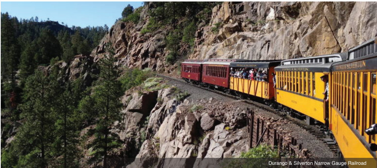
Durango & Silverton Narrow Gauge Railroad

DAY 6 Cumbres & Toltec Scenic Railroad: Your day begins as you board the motorcoach and ride to the Cumbres & Toltec Scenic Railroad, the original Rio Grande Line. This is America's most spectacular narrow gauge steam railroad. Explore 50 miles of wild and rugged territory between Chama, New Mexico and Antonito, Colorado, the highest point on the railroad. Meals: B, L